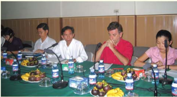
The semi-annual meeting to update program progress of the GFATM grants 12 July 2005