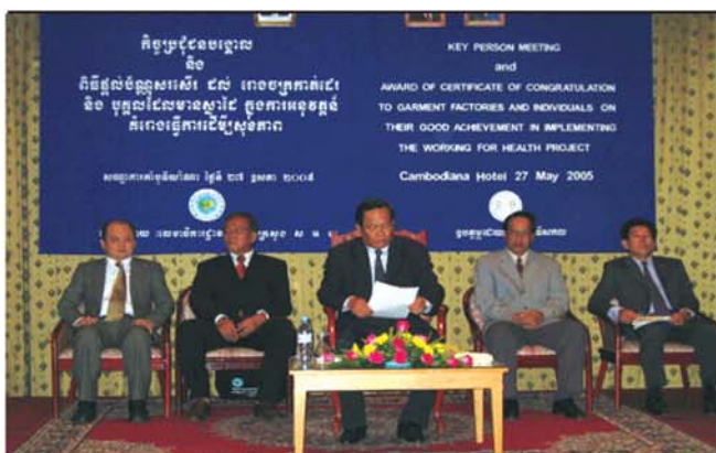
H.E.Ith Sam Heng , Minister of Social Affairs, Veterans and Youth Rehabilitation, during the ceremony to award certificates to garment factories

H.Excellency awarded certificates to 10 factories and ToT workers, also extended some advices and motivational comments to them to continue to educate factory workers in AIDS prevention.